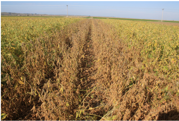
Figure 2. Image of the 2.0MG product in the +Boron fertigation treatment.