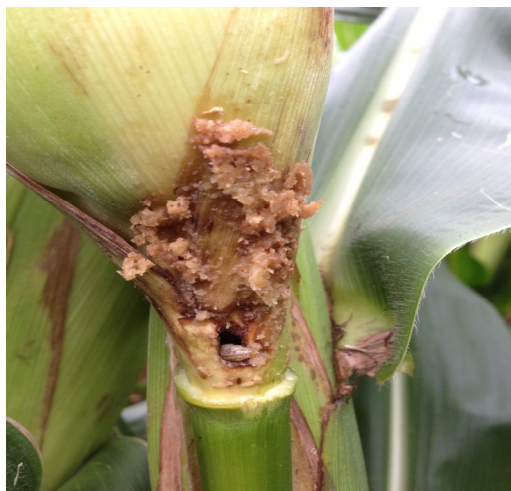
Figure 2. Second generation European corn borer feeding in ear shank and associated frass.

Begin scouting for second generation egg masses when ECB moths are found in light or pheromone traps. Fields most likely to be infested have green, succulent corn plants with shedding pollen or green silks in late July and early